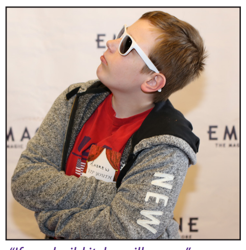
"If you build it, he will come."