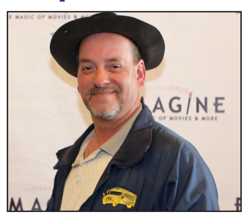
"I'll be back."