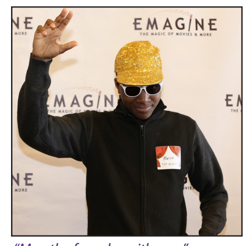
"May the force be with you."